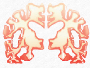
Mild Alzheimer's Disease